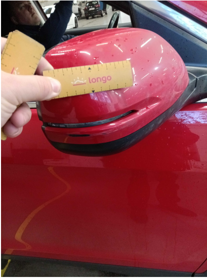
2. SIDE: Exterior mirrors - integrity of mirror itself and attachment to car