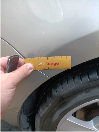
image / scratches